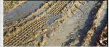
EARTH AND MUD